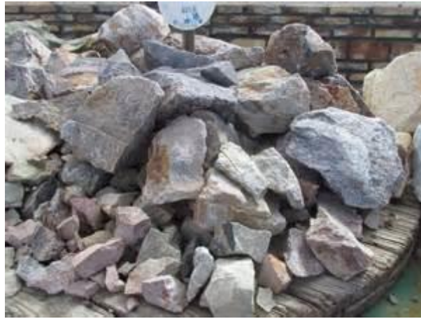
Rough soapstone for carving